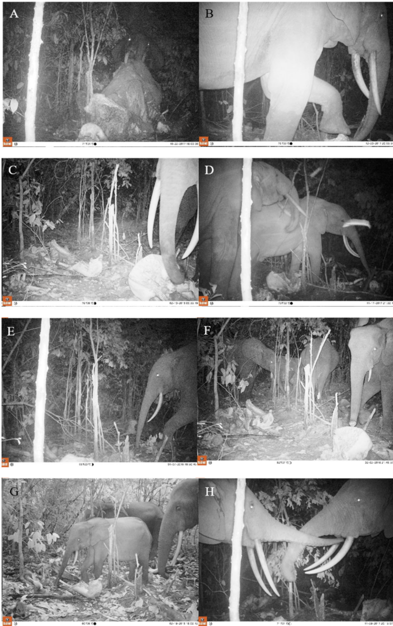
Figure 2. Frequently observed elephant behaviour at the carcass site: (A–C) interaction with the dead body; (D) interaction with the vegetation; (E) looking at the carcass; (F, G) directing trunk towards carcass; (H) interaction with other elephant.